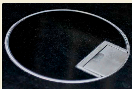
Ref 7RO, diameter 193mm to accept 2 outlet plates

193mm diameter box accepts any two outlet plates*